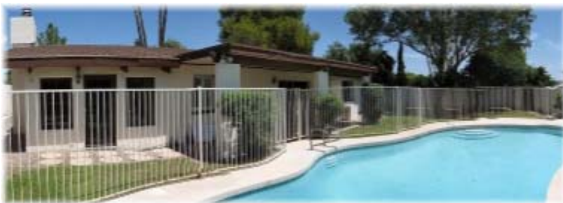
The large backyard is absolutely beautiful!