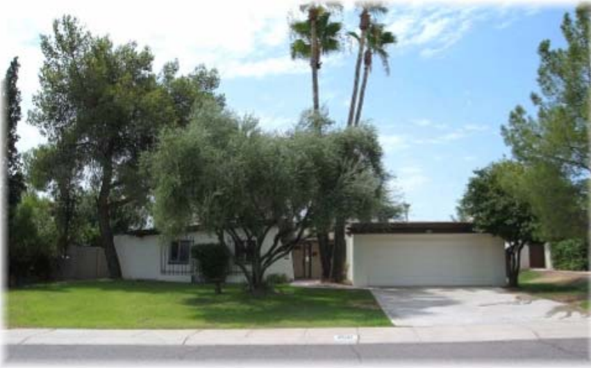
2541 E. Beryl Avenue